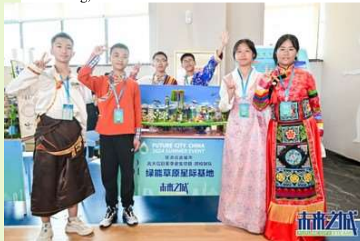
Student participants in the Future City Competition